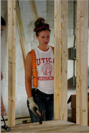
Out of state youth groups work on second floor

Summer missions trips brought close to 400 youth to Adullam from all across the United States and Canada for week long urban missions training opportunities. Many of the leaders and sponsors have since been in contact with Adullam to share stories of young lives set on fire with a passion to make an impact in their own home communities with the simple grassroots initiatives experienced at Adullam. During 2011, active partnerships with suburban churches and outreach organizations brought in regularly scheduled “work day” event groups ranging in size with up to 80 people per event.