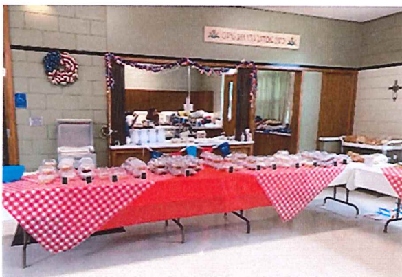
LWML Summertime Pie Social