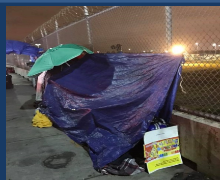
Under this tarp are 3 children and 4 adults sleeping in the cold and drizzly weather. They are asylum seekers in line at the international bridge in Matamoros

P.S. To see your donations in action, follow-along on my mission journey December 2-7. I will be posting on my Facebook page.