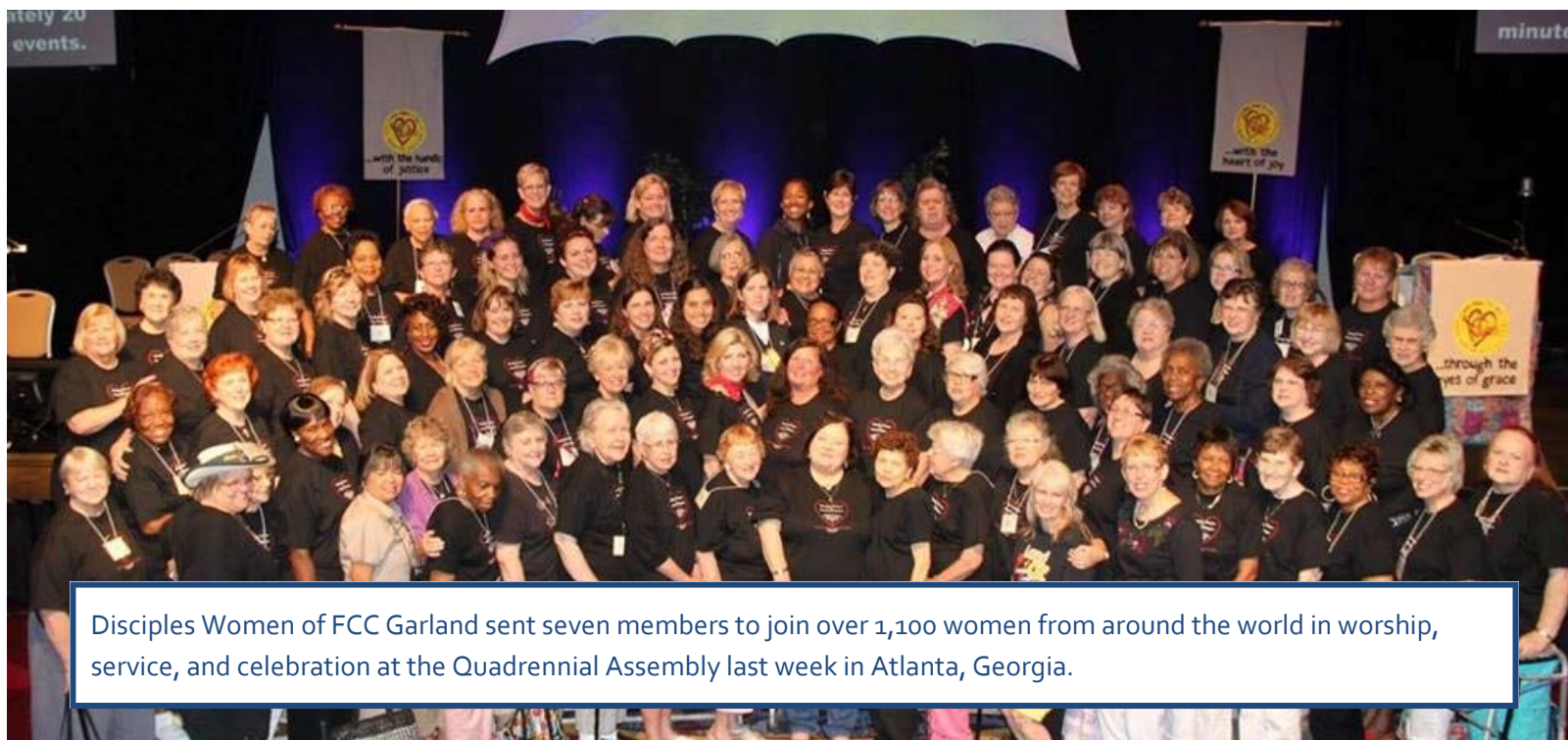
Disciples Women of FCC Garland sent seven members to join over 1,100 women from around the world in worship, service, and celebration at the Quadrennial Assembly last week in Atlanta, Georgia.