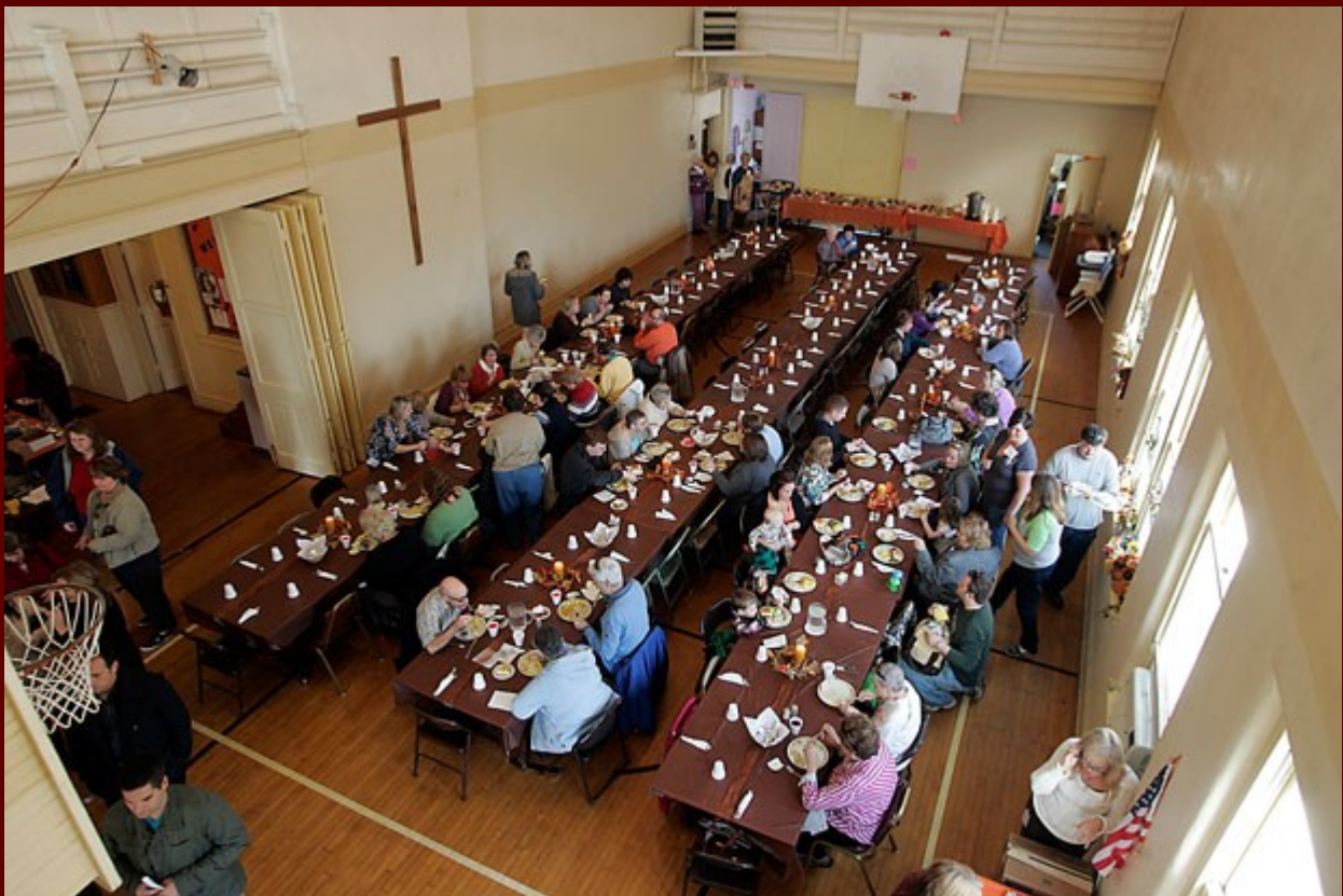
Community Breakfasts are held the last Saturday of each month.