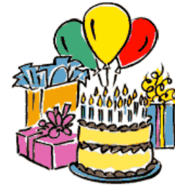
OUR PASTOR'S BIRTHDAY