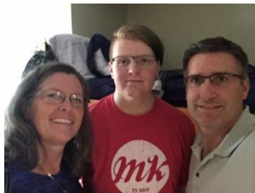
D and K dropping S off at university!