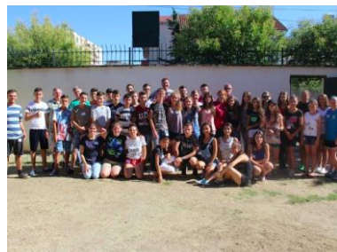
The River Church (Marion, IN) helped host English Camp