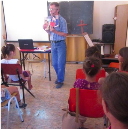
A teaching at CEF camp this summer