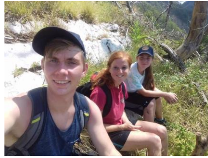
N, E, G -- taking a break on their 8 hour hike!