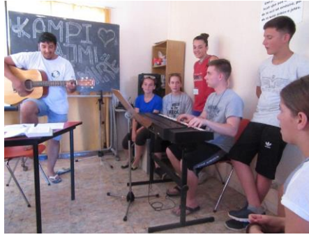
N, G, P, and K singing the worship song they wrote at kids camp