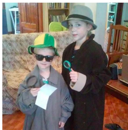
While English Camp was going on, J and H were playing detective!