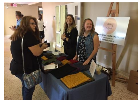
The River Church (Marion, IN) selling our Anti-Human Trafficking products!