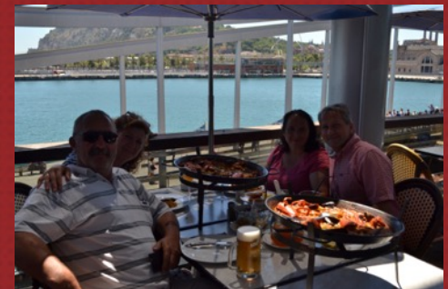
Dinner in four - our anniversary