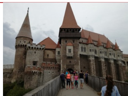
Hunyad Castle, on a tour