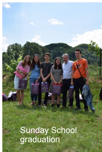
Sunday School graduation