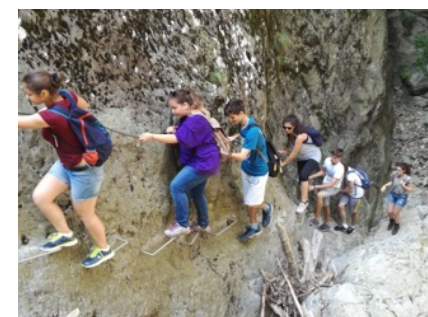
Craiova teenage group