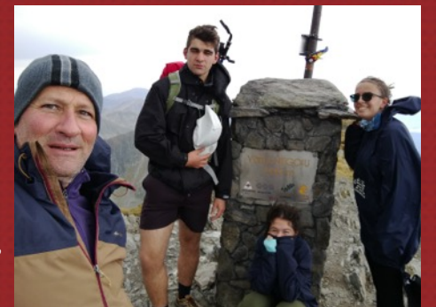
On the second highest peak