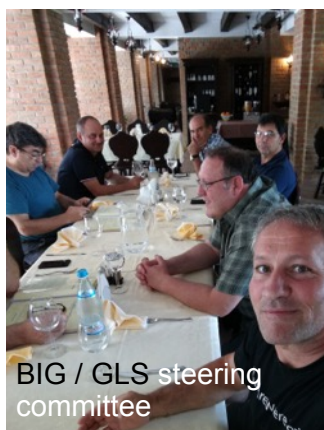
BIG / GLS steering committee