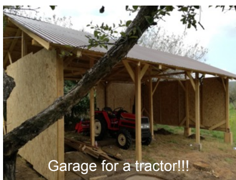
Garage for a tractor!!!