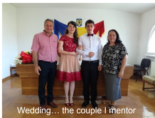
Wedding... the couple I mentor