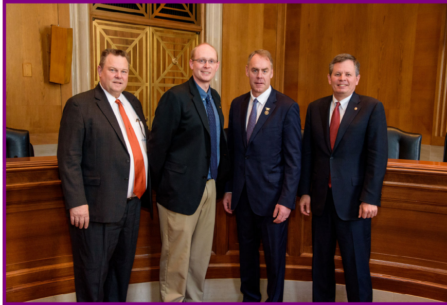
Senator Tester, Cole Harden, Representative Zinke and Senator Daines