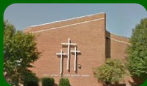
First Rising Mt. Zion Baptist Church "81 Years of Walking by Faith"