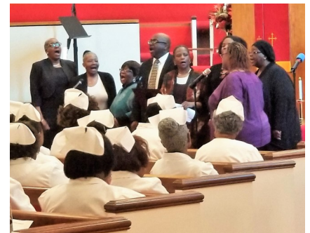
The Moore Specials