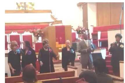
The Vintage Gospel Singers of Washington, DC and Vicinity.