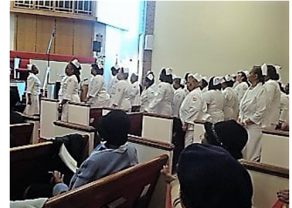
Nurses from 26 churches in the metropolitan area joined the celebration.

Congratulations FRMZ Nurses for a job well done!