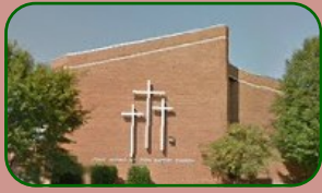
First Rising Mt. Zion Baptist Church "81 Years of Walking by Faith"