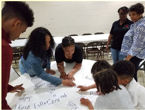
Members of the Girls Auxiliary and others enjoy First Friday . This was a team race to put the books of the Bible in order. THIS TEAM WON!

Phone: (O) 202-289-4480 (H) 301-350-3223 Email: (O) missionstar@firsrising.org (H) owhite3223@aol.com