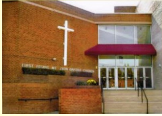
First Rising Mt. Zion Baptist Church 82 years of walking by faith.