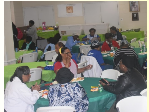
Scene from Church Anniversary Fellowship Day , May 19, 2018.