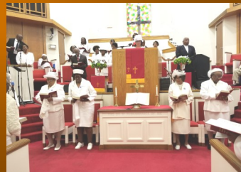
Fifth Sunday Call to Worship

"Ye are the light of the world." What the luminaries — the sun and moon are in the heavens with respect to corporal light, as were the apostles—so are we, who have been born again in the world with regard to spiritual light, carrying and spreading the gospel.