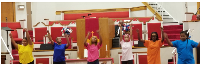
The God’s Promise Dance Ministry performs to “Every raise” at the Friday night celebration service.