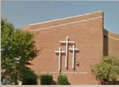
First Rising Mt. Zion Baptist Church "82 Years of Walking by Faith"