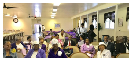
First Rising members are in the house.