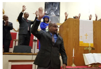
Halleluiah! Praise Him!