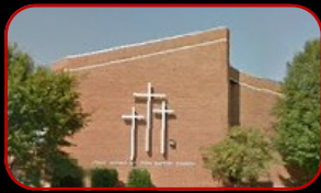
First Rising Mt. Zion Baptist Church "81 Years of Walking by Faith"