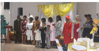
Yellow Rose Tea Fashion Models

As we move into the year 2020, we are left with the challenge to continue seeking the guidance of the Holy Spirit as we work together for His Kingdom Building. The question is: "Can God count on you"?