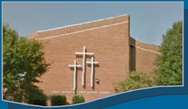
FIRST RISING MT. ZION BAPTIST CHURCH "For we walk by faith, not by sight" 2 Corinthians 5:7