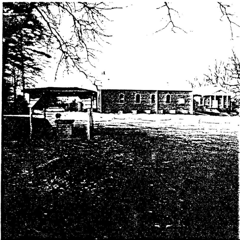
A SIDE VIEW OF THE SANCTUARY BUILDING AND THE EDUCATIONAL BUILDING WITH THE WELL IN THE FORE-GROUND.

which provides room for expansion. Much of the work on this building was done by church members. Many times the same men were there night after night after working all day at their jobs and then they worked all day on Saturday. This building was dedicated to the Lord's work August 3, 1984.