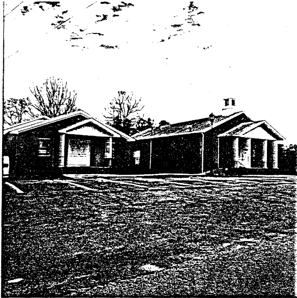
FRONT VIEW OF THE BUILDINGS SHOWING THE REMODELED ANNEX OF THE ORIGINAL CHURCH BUILDING AND THE SANCTUARY BUILDING WHICH WAS BUILT IN 1967.

In 1967, the present sanctuary building was built with classrooms in the basement. The first service was held in this building on Mother's Day, 1967.