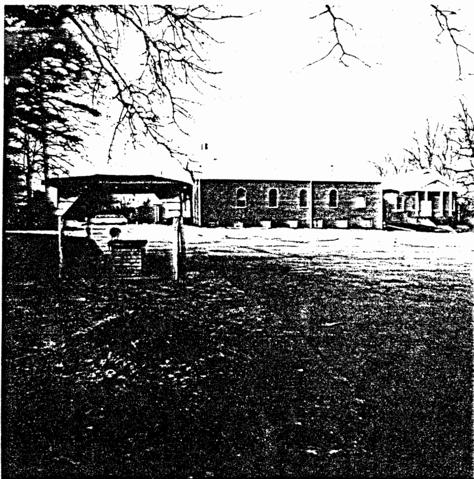
A SIDE VIEW OF THE SANCTUARY BUILDING AND THE EDUCATIONAL BUILDING WITH THE WELL IN THE FORE-GROUND.

which provides room for expansion. Much of the work on this building was done by church members. Many times the same men were there night after night after working all day at their jobs and then they worked all day on Saturday. This building was dedicated to the Lord's work August 3, 1984.