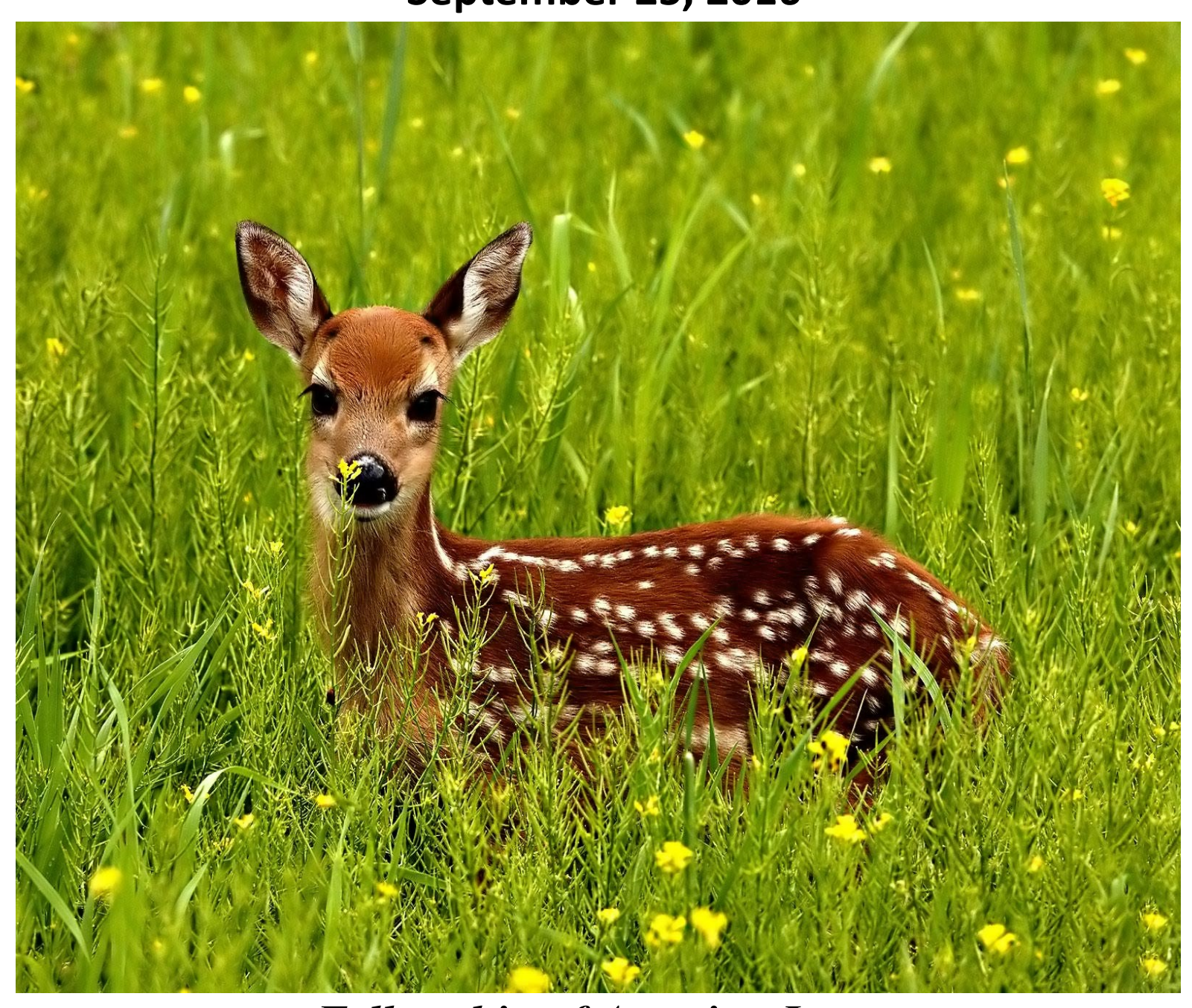
Fellowship of Amazing Love 499 Chestnut Ridge Road, Laurens, South Carolina 29360