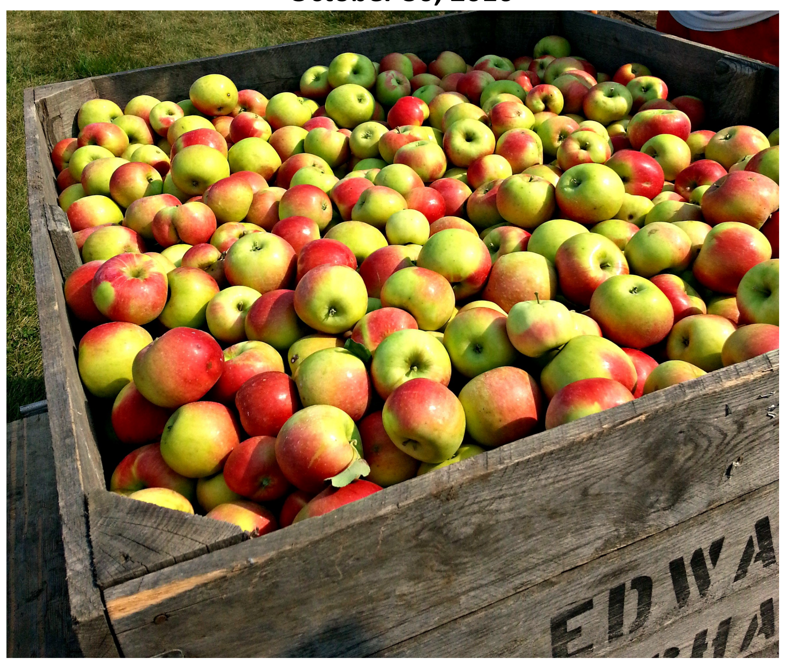
Fellowship of Amazing Love 499 Chestnut Ridge Road, Laurens, South Carolina 29360