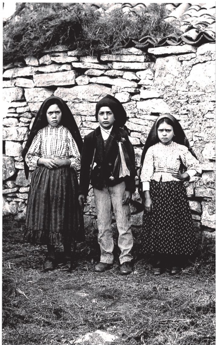
The Children of Fatima – Lucia, Francisco, and Jacinta •

Parish Library: Please visit the parish library next to the church located in the elevator foyer. The library is open everyday and books are available for check out.