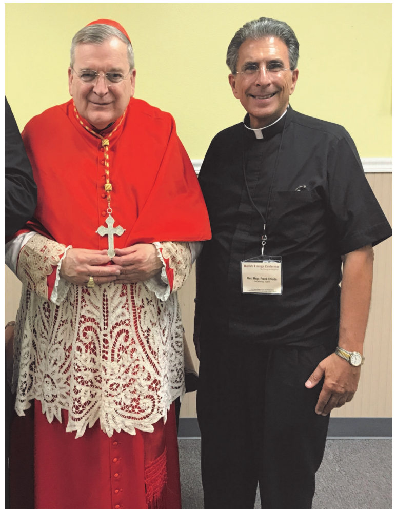
Msgr. Chiodo with Cardinal Raymond Burke at the liturgy conference.

Parish Library: Please visit the parish library next to the church located in the elevator foyer. The library is open everyday and books are available for check out.