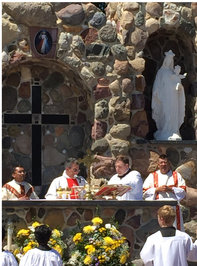
2018 Corpus Christi Mass at the grotto.

Parish Library: Please visit the parish library next to the church located in the elevator foyer. The library is open everyday and books are available for check out.