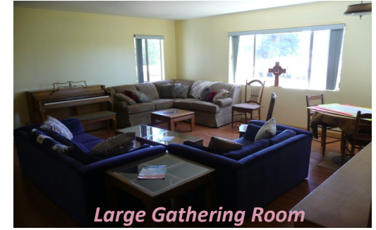
Large Gathering Room