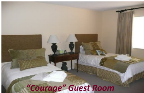
"Courage" Guest Room