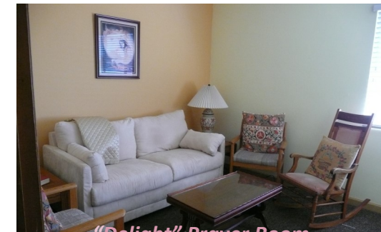
"Delight" Prayer Room