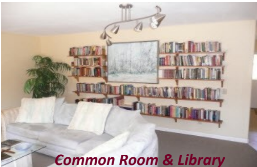
Common Room & Library