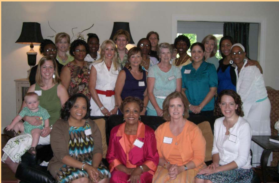
H. I. S. BridgeBuilders Luncheon