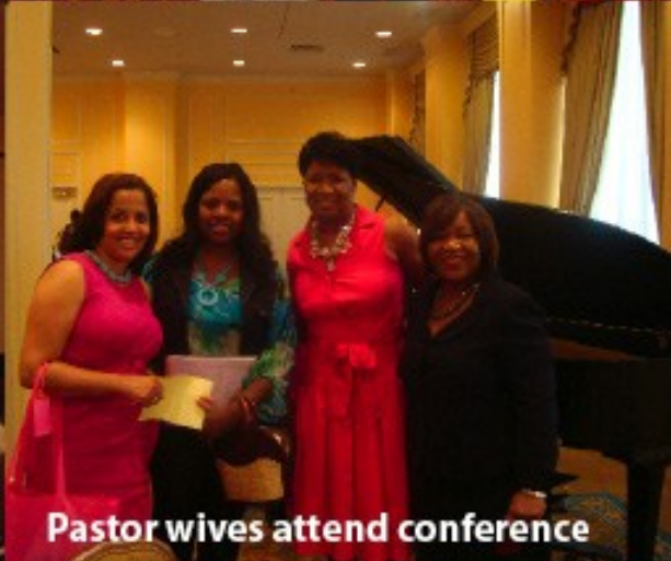
Pastor wives attend conference