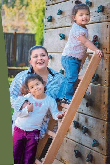
Parents and children learn to set and accomplish goals, such as obtaining an accounting degree or improving their school grades. Each success is rewarded through the Accomplishments Rewards Program!