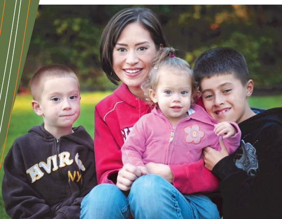
Parents and children learn how to manage their money while at Vine Maple Place. "I know now that living on a budget leads to reaching my long term financial goals", explains this mom.

A safe, stable home for every child and parent