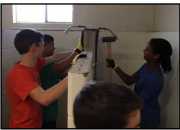
The work you did is very much appreciated!