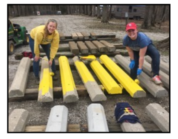
Contact us if your group would like to schedule a service day.