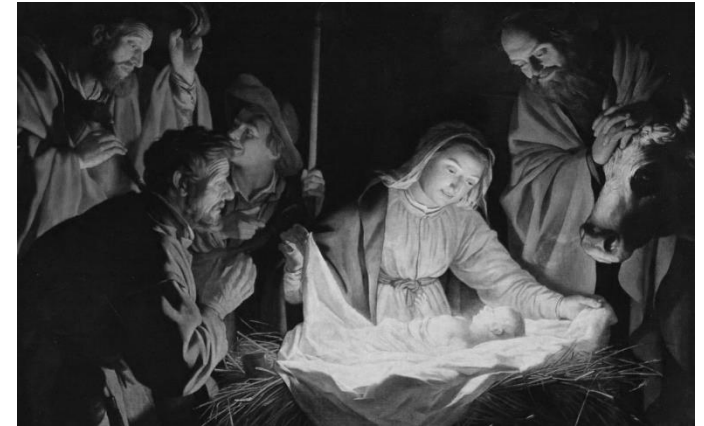
The Nativity by C.S. Lewis

As we approach the celebration of Jesus Christ’s birth take some time to reflect on the following poem by C.S. Lewis. C.S. Lewis was an extraordinary writer (think Chronicles of Narnia, Mere Christianity) who did not personally know Jesus Christ as Lord and Savior until much later in life. The following poem reflects his understanding of the glorious birth of Jesus.