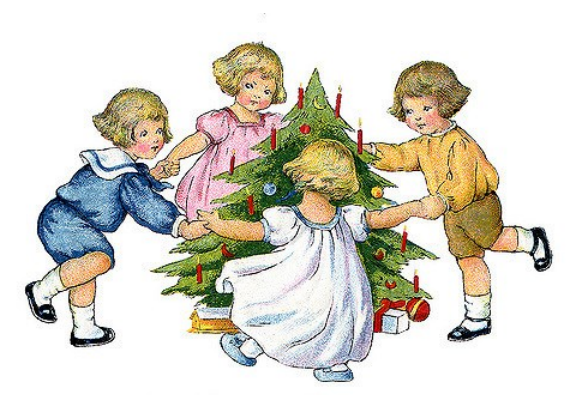
A Toyful Christmas