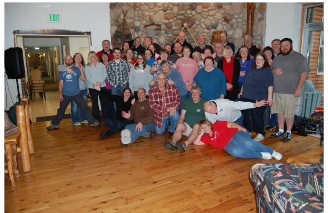
BAG Group Photo 2016 Jim Creek WA