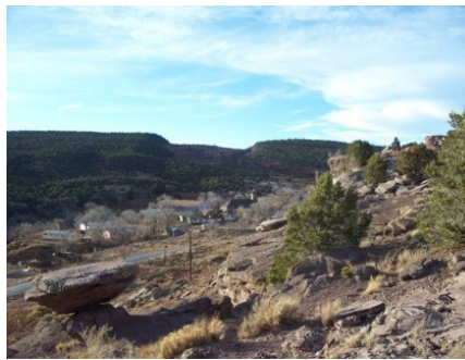
Fort Defiance, Navajo Nation