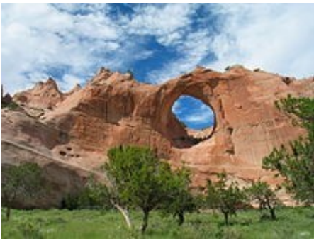
Window Rock, Navajo Nation

If you sign-up & pay $50 by October 15 the cost is $375/person (+ travel meals). The cost goes up to $405 on October 16 & will be subject to availability. (See Ellen about scholarships.)