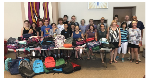
Flight 33 Backpack Filling Event