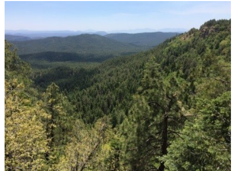
AZ High Country