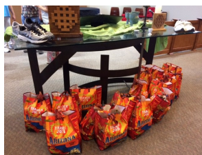
Veteran’s Pride Bags