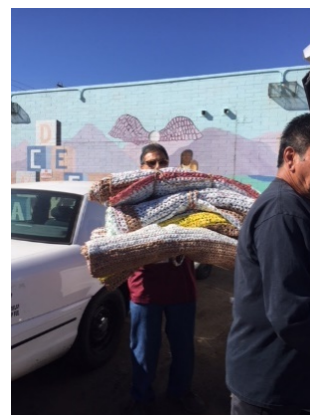
Mat Delivery to Justa Center