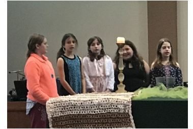
Children's Ensemble Singing February 4, 2018!