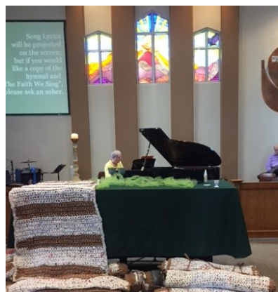
Mats Displayed at DFUMC