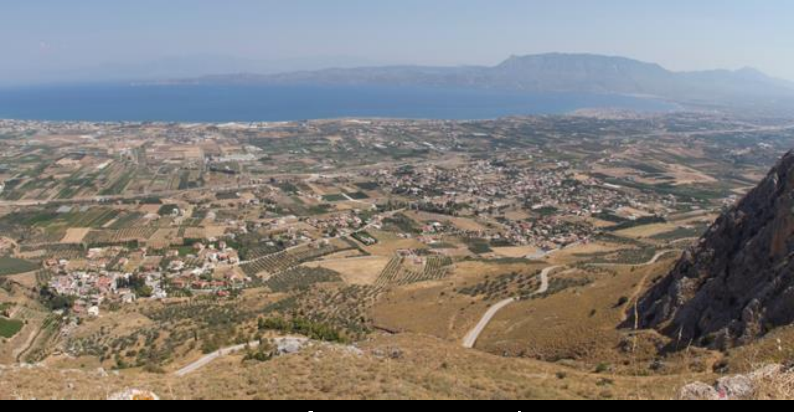
View from Acrocorinth