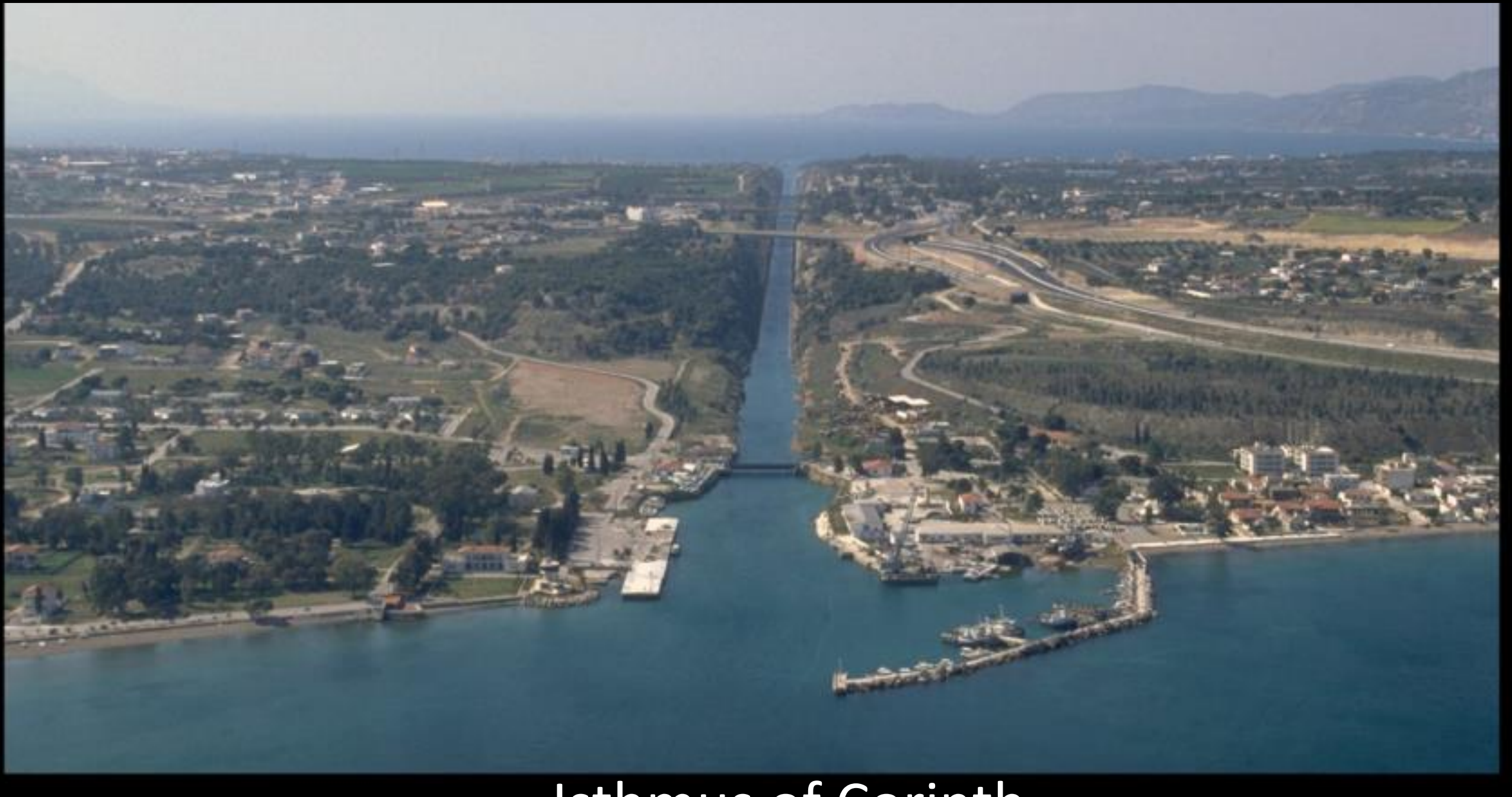
Isthmus of Corinth