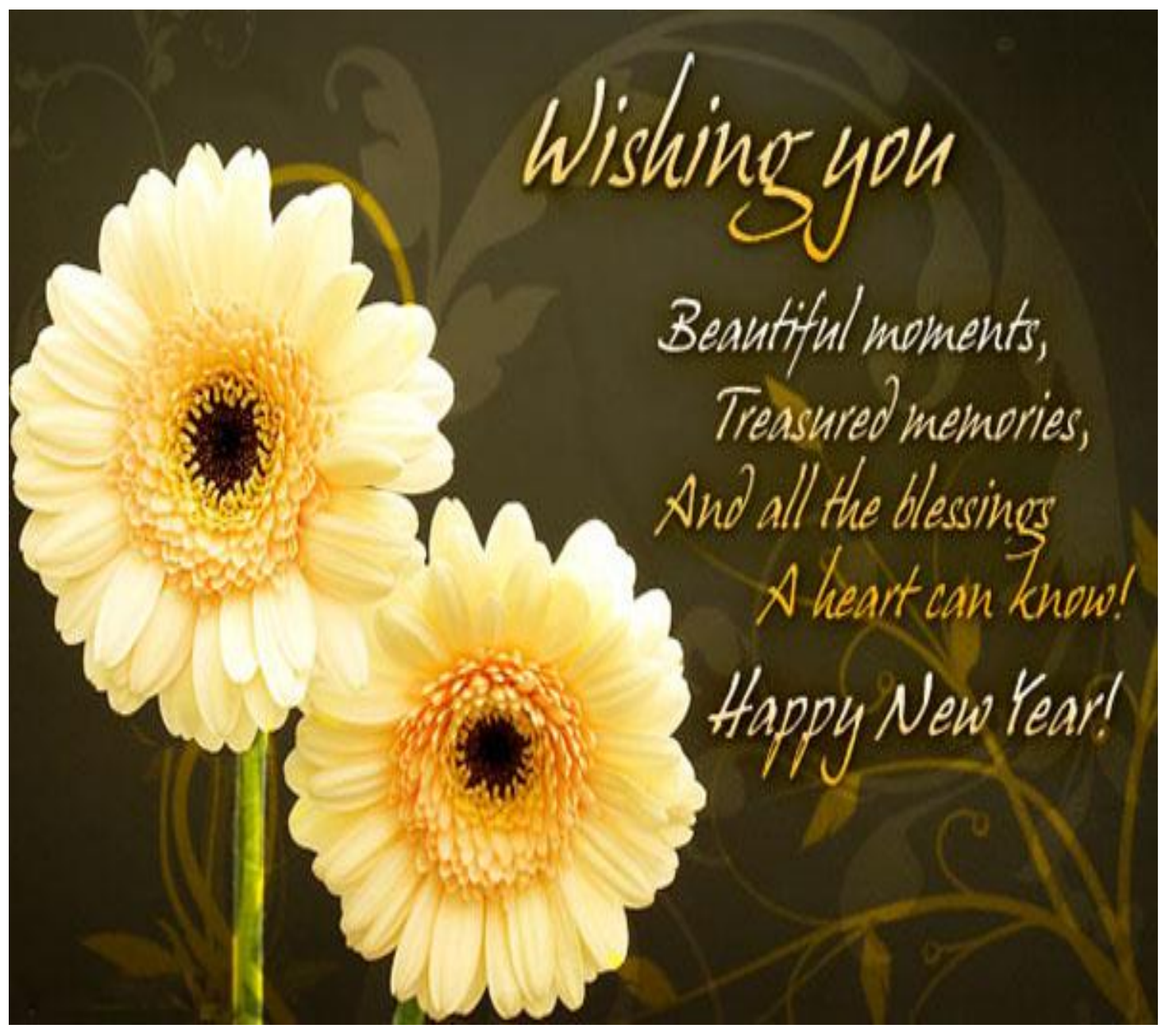
January 2018 Newsletter