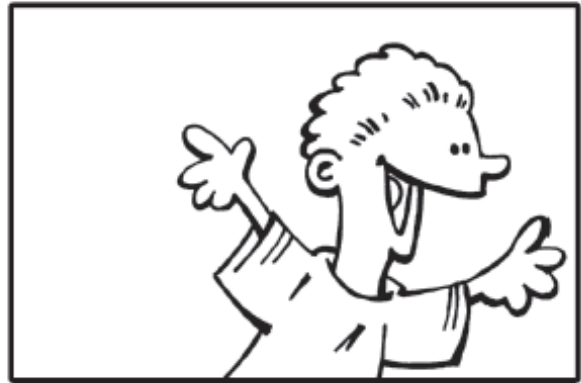
God Calls Samuel 1 Samuel 3:1-10