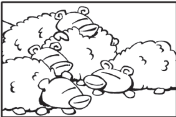
The Lord Is My Shepherd Psalm 23