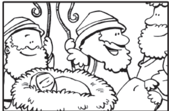
The Birth of Jesus Luke 2:1-20