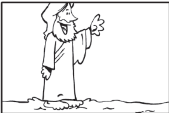
Jesus Walks on Water Matthew 14:22-33