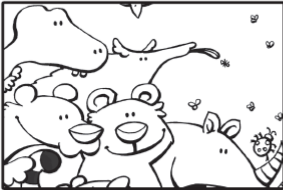
God Creates Sea Animals and Birds Genesis 1:20-22