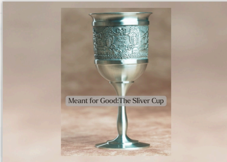
Meant for Good: The Silver Cup