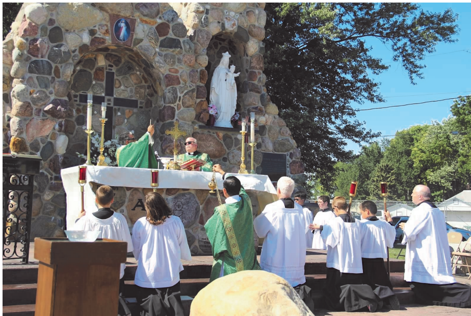
Fall Festival 2013 Grotto Mass

Diocesan Shrine of Our Lady of Mount Carmel and Divine Mercy 15 Indianola Rd., Des Moines, IA 50315 ~ 515-244-4709 ~ www.stanthonydsm.org